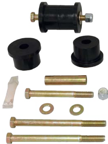
TCP LSP-04 - Front-Eye Bushing Set

* Items can also be purchased separately.