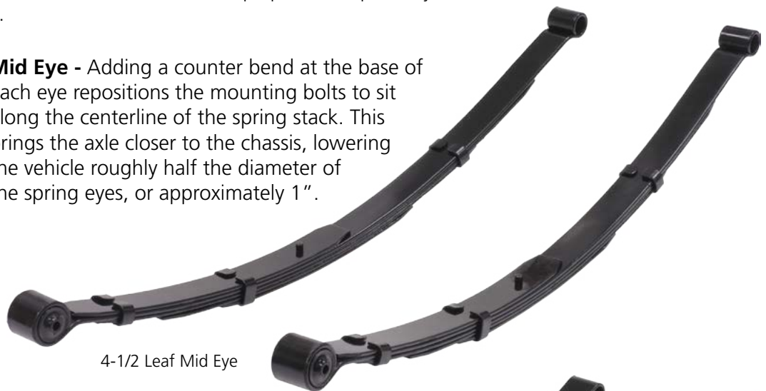
4-1/2 Leaf Mid Eye

Mid Eye - Adding a counter bend at the base of each eye repositions the mounting bolts to sit along the centerline of the spring stack. This brings the axle closer to the chassis, lowering the vehicle roughly half the diameter of the spring eyes, or approximately 1".