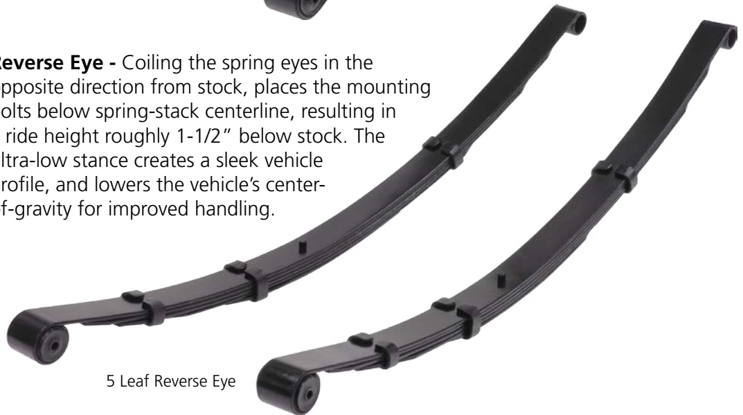
5 Leaf Reverse Eye

Reverse Eye - Coiling the spring eyes in the opposite direction from stock, places the mounting bolts below spring-stack centerline, resulting in a ride height roughly 1-1/2" below stock. The ultra-low stance creates a sleek vehicle profile, and lowers the vehicle's center-of-gravity for improved handling.