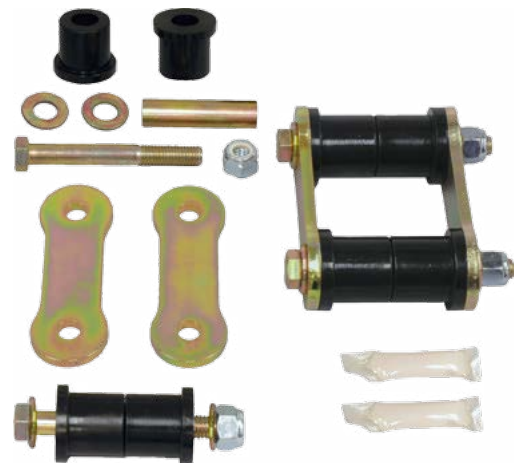
TCP LSP-05 - Rear-Eye Shackle Set