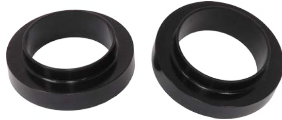
TCP SVM1-03 (above) - 1" thick spring isolators, black urethane, raises ride height approximately 1-1/4"