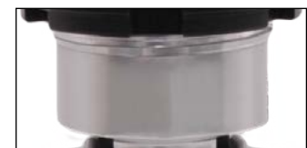
SensiSet Factory Valved