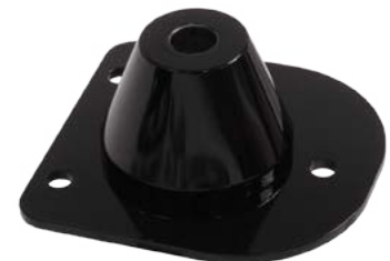
Spot-Weld Removal Bit