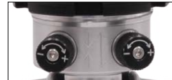
QuickSet 2 Double Adjustable