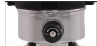
QuickSet 1 Single Adjustable