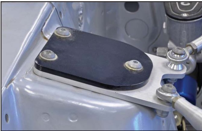
Full Coil-Over mounted ABOVE - lowered ride height