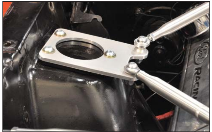
Full Coil-Over mounted BELOW - standard ride-height