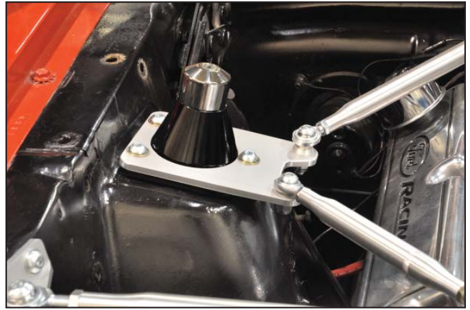
Bolt-On Coil-Over mounted BELOW - standard ride height

Placing the coil-over mount ABOVE the tower-brace plate lowers the ride height approximately 1/2".