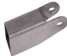
5322 & 5323 - Engine Mount Frame Adapter