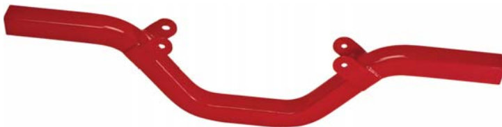
6060 - Billet-Mount Engine Crossmember

Custom-Fit Installations - The mount can be bolted to the engine block in either direction for greater flexibility in positioning the engine crossmember or frame adapters.